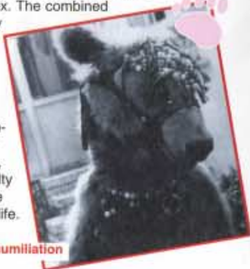
The ultimate humiliation

effect of captivity and maltreatment produces behavioural disturbances, expressed in repetitive (stereotyped), purposeless movements, that it has difficulty shaking off in the remainder of its life.