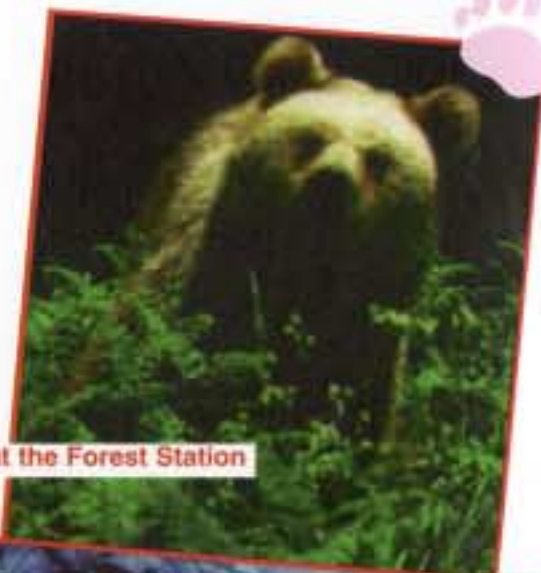
Tassoula at the Forest Station