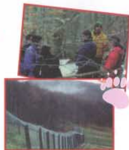
The Bear Sanctuary Forest Station at Nymphaio, Prefecture of Florina

Visitors to the Bear Sanctuary Forest Station listen to the guide